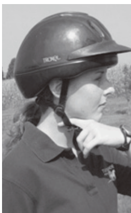
Correct Harness Fit

* Bend over at the waist and shake your head. With the harness secured, the helmet should move very little.